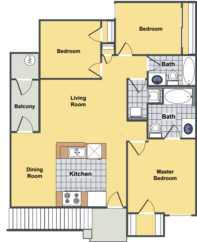
Three Bedroom/Two Bath 1,201 Sq. ft.