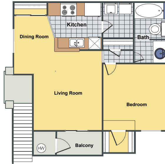
One Bedroom/One Bath 730 Sq. ft.

*pet fee and pet deposit apply **in select homes